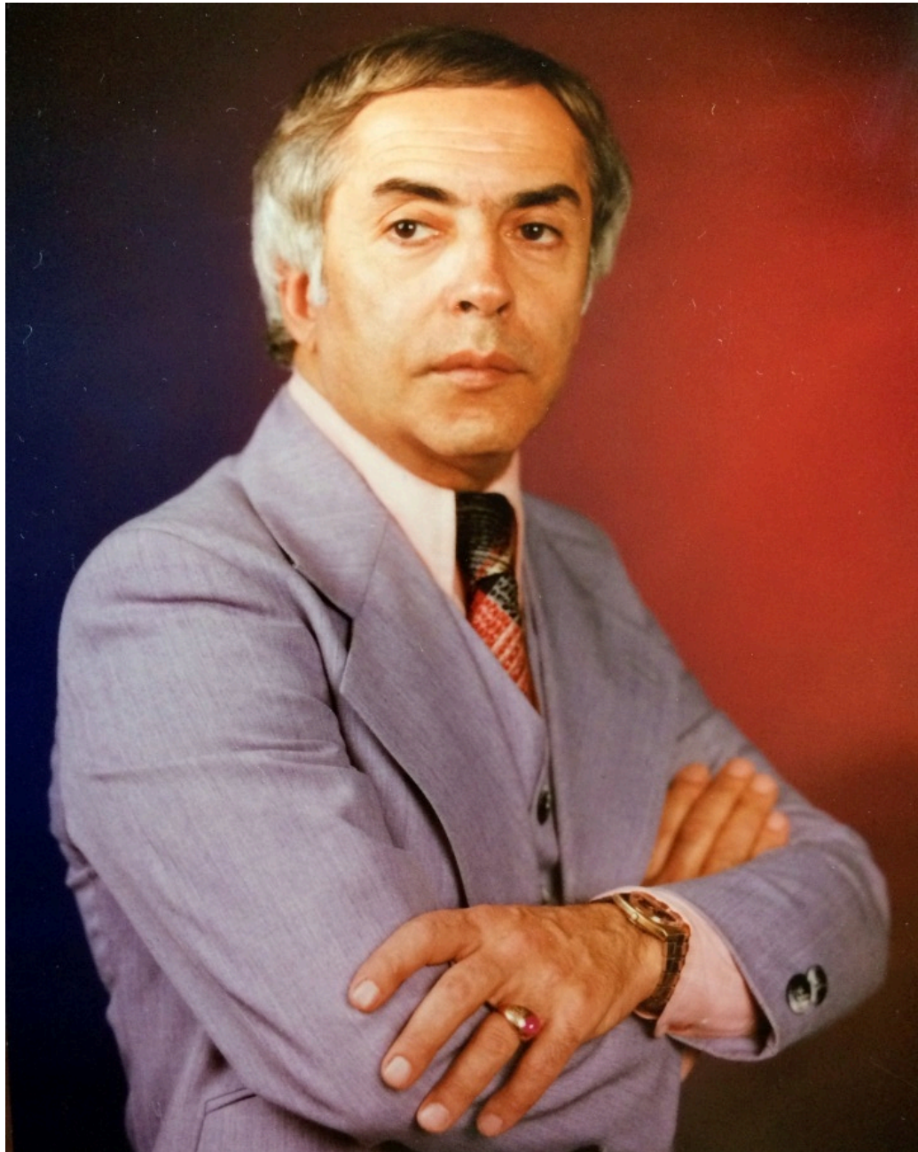
Konstantin Orbelian 1928 - 2014